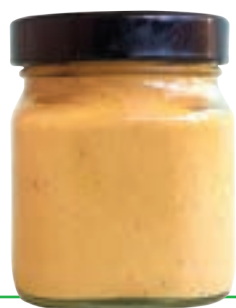
Hummus pasteurized 290g