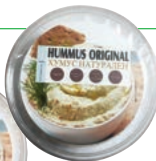
Hummus original 200g