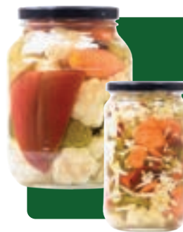
Turshija - mixed pickled vegetables