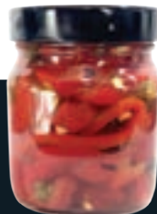
Royal salad from grilled peppers