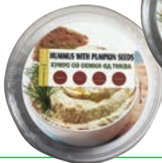
Hummus with pumpkin seeds 200g