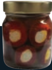
Rodeo peppers with cottage cheese filling