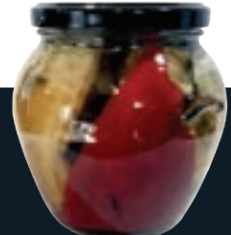
Grilled vegetables mix